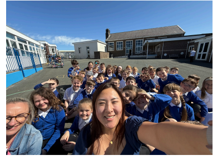
Attempted to get everyone in a Year 4 selfie...