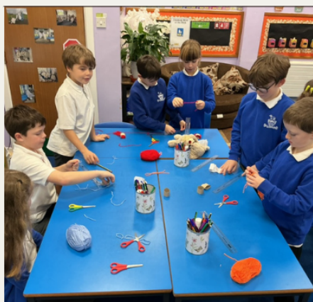
Bobble hat making