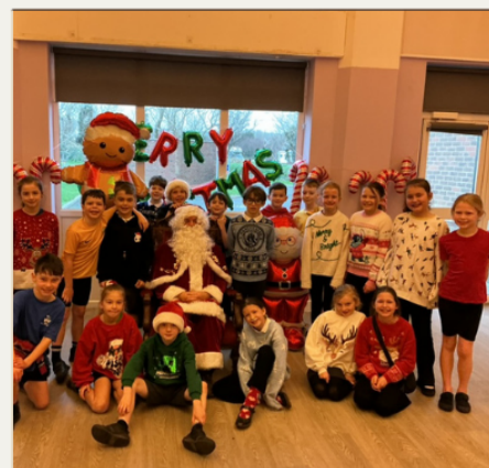
Breakfast with Santa