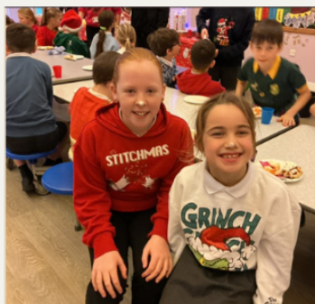
Breakfast with Santa