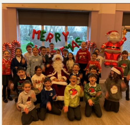
Breakfast with Santa